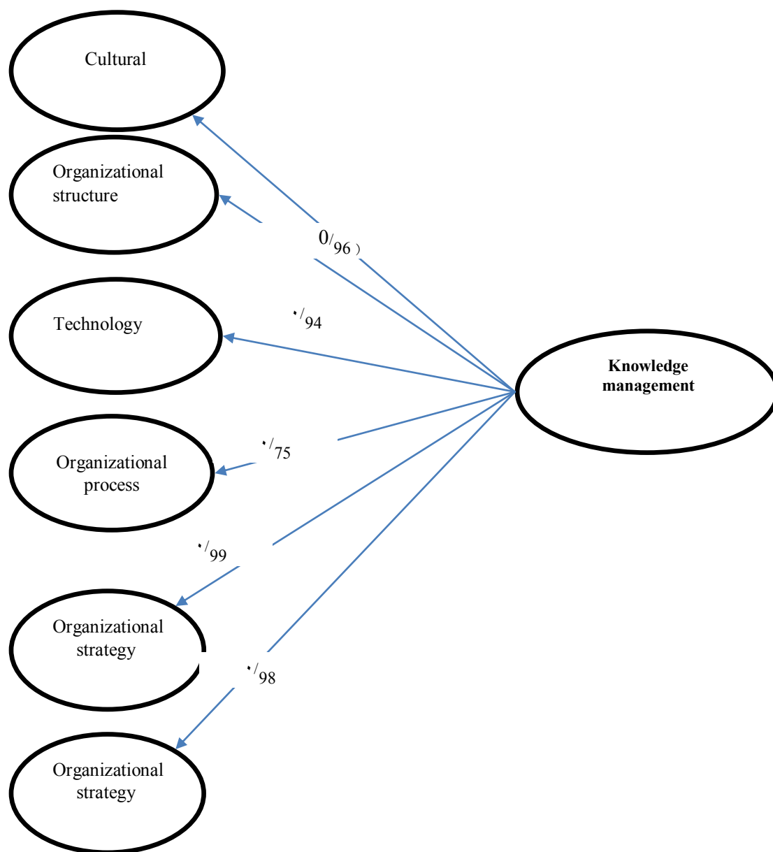
Figure 1. Second-order knowledge management measurement model with standardized coefficients

In the model in Figure 1, the numbers displayed on the arrows are standardized coefficients. The standardized coefficients are the same as the model coefficients that have been transferred to the range of 1-1 to 1, and therefore it is possible to compare them for different variables. However, according to the results obtained from this model, it is t > 1.96 for all components and therefore all these coefficients are significant (detailed results can be seen in the appendix). Therefore, all components have a significant role in explaining their dimensions. Table 4-13 now shows the fit indicators of the first-order knowledge management measurement model. If the values of the fit indices are in the desired range, they indicate the suitability of the model for the collected data. The second-order measurement model of organizational learning includes its various dimensions as latent first-order variables and the components of each of them as explicit variables. In this model, the latent variable is the second level of organizational learning that is displayed, which can be seen on the next page, in this model for all dimensions and components > 1.96 . Therefore, all dimensions and components have a significant effect in this model.